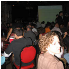
Posted by: Fiona J. Clem

Business/Location: HR-57 Center for the Preservation of Jazz and Blues Address: 1810 14th St NW City: Washington State: DC Zip Code: 20009 Phone: 202-687-3700 Website: www.hr57.org